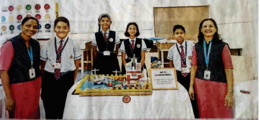
Students presenting their model during Avishkar Interschool Competition