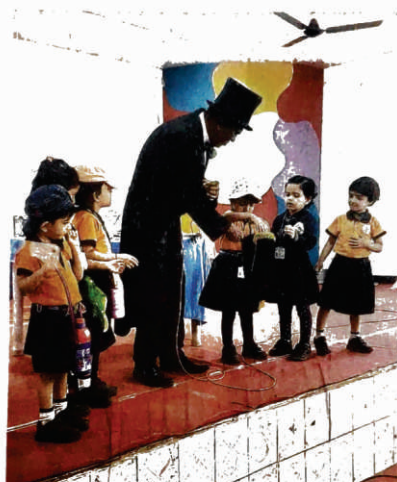
Kids enjoying magic tricks during their picnic

There were lots of exciting activities lined up to entertain all the students. The volunteers at the farm took charge of all the stu-