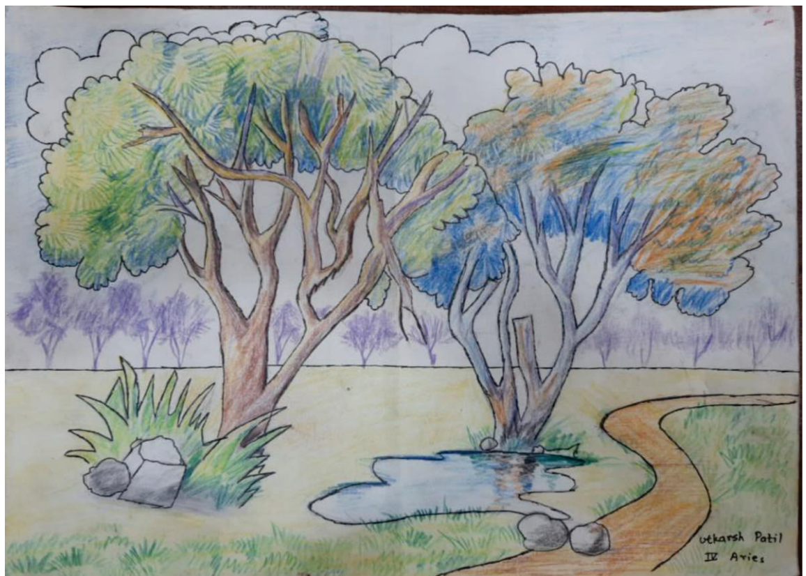
Utkarsh Patil IX Aries