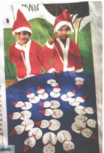
Paper snowman craft activity by students

The little ones prepared a paper snowman too. As Santa Claus distributed chocolates and danced with the little ones, excitement and enthusiasm was visible everywhere. It was a memorable, joyful and a cool red day for the tiny tots as their innocent faces were gleaming and reflecting with brightness, joy, love and happiness.