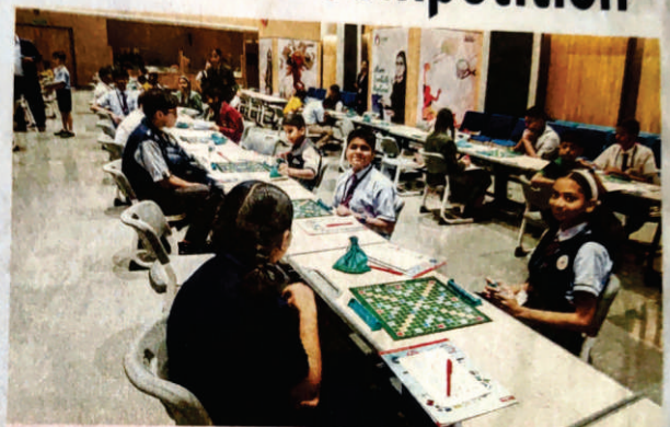
Students showcasing various techniques at the Scrabble competition

awarded a trophy and a kit of Scrabble game, making them feel really proud and overjoyed. Our school stu-