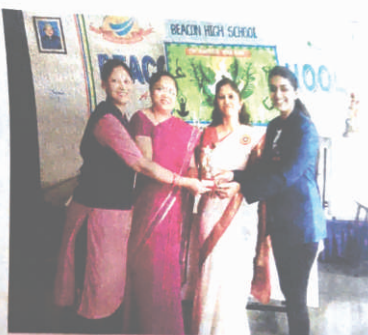
Awarded trophy for 'The Most obedient School'

It was a great day for the students of AIS as the school was awarded with the trophy of 'Most Obedient School'. The principal and school management congratulated all participants for this remarkable achievement.