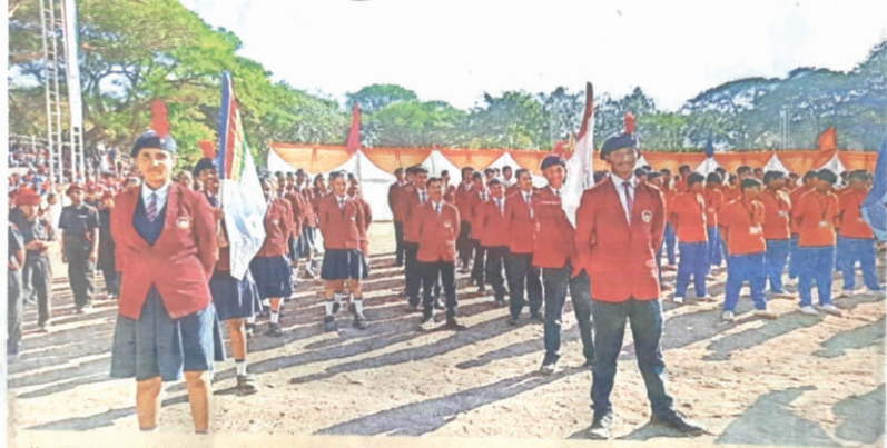
March Past Drill by little soldiers of Ashwini International School

To express gratitude to the Indian Army, Army Day is celebrated every year on January 15, all over India. It is a historic day because on this day Cariappa, who led Indian forces to victory in the 1947 war, took over the command of the Indian Army from General Sir FRR Bucher, the last British Commander-in-Chief in 1949 and became the first Indian Commander-in-