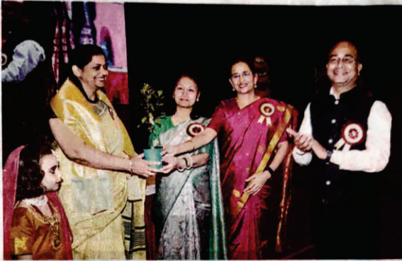
Felicitating Chief Guest on Annual Day