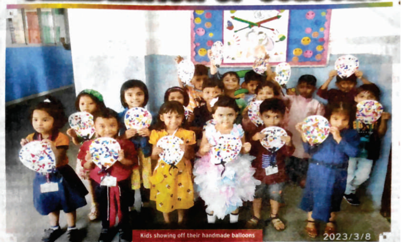
Kids showing off their handmade balloons