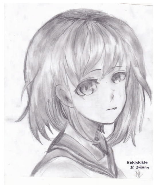
Abhishikta IX Saturn